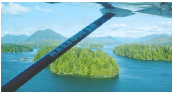
The view from the Harbour Air plane shows off the magnificence of B.C. SUZANNE MORPHET

Pacific Surf Co. A three-hour group lesson costs $89 per person. Open every day but Christmas. Reserve online ( www.pacificsurfschool.com ), at their office at 441 Campbell Street, or call toll-free 1-888-777-9961.