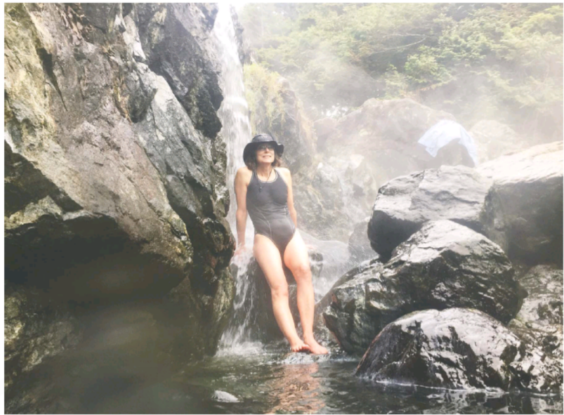
The water temperature at the geothermally heated springs at Hot Springs Cove, located in Maquinna Marine Provincial Park on Vancouver Island, is 50 C.