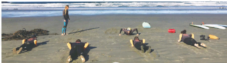
An instructor from Pacific Surf Co. teaches novice surfers how to catch a wave.