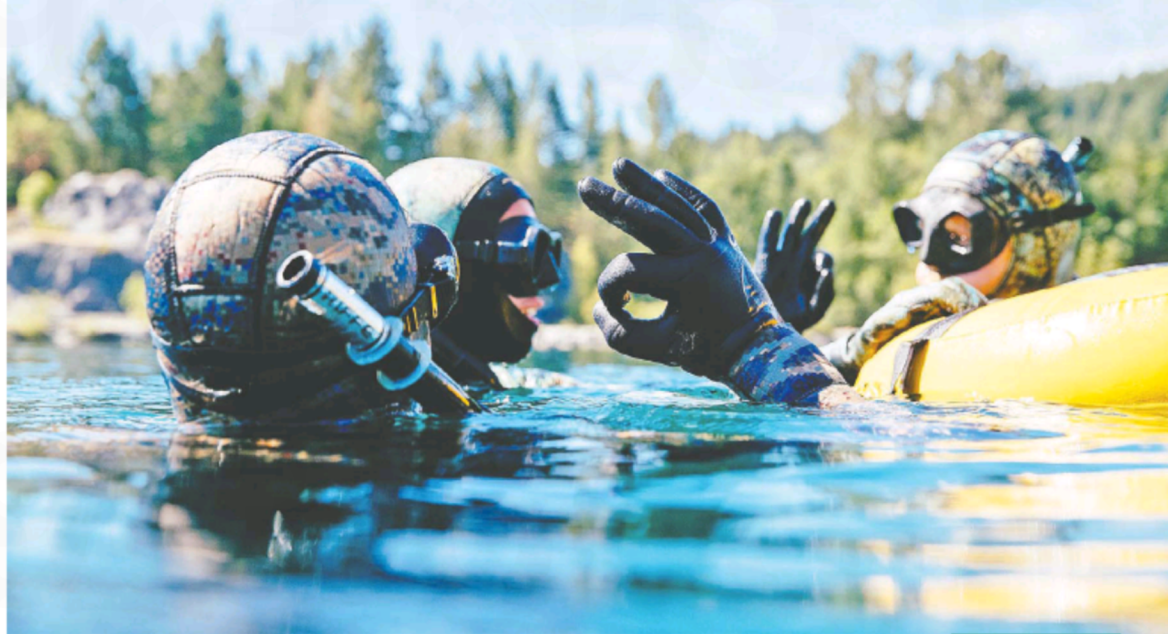
Freediving with Tofino Resort + Marina is a great way to explore the wildlife off the coast of Vancouver Island.