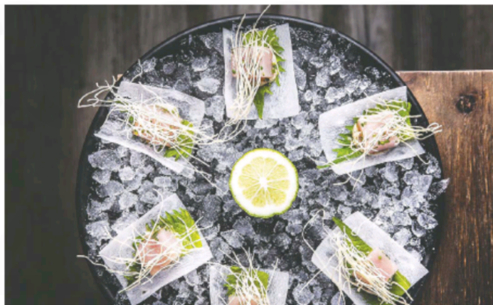
Hard to top the visual delight of albacore tuna with white radish tacos served at 1909 Kitchen. LEILA KWOK

Park your bikes near the Carving Shed at the north end of Chesterman Beach and see what local carvers are working on (and selling) before heading into The Wick. It was the inn's McDiarmid family who helped make Tofino a storm-watching destination in winter, but even on a calm day, the 240-degree view of the ocean and beach from The Pointe is spectacular. Also of note is the inn's new wine cellar. With its extensive selection of wines and a six-metre slab of yellow cedar for a table, the cellar can be reserved for private parties. (Note: The Wickaninnish hopes to reopen to B.C. residents on June 22 and the rest of Canada on July 6.)