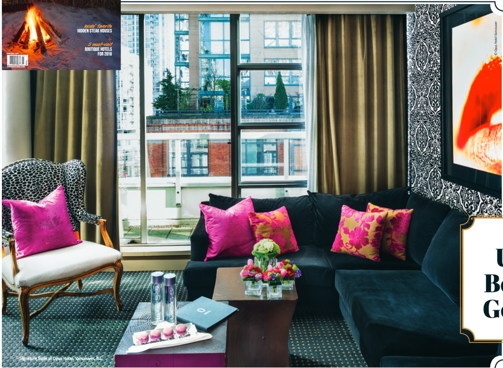
Signature Suite at Opus Hotel, Vancouver, B.C.