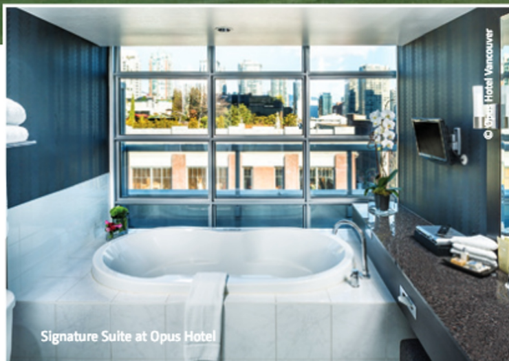
Signature Suite at Opus Hotel