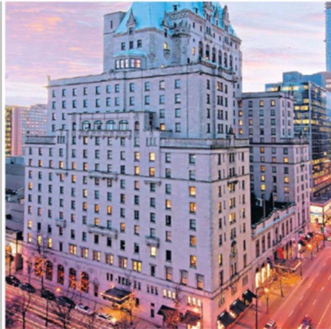
Scenes from Fifty Shades of Grey were shot in the Fairmont Hotel, left

eyes") is steps away from film locations, such as Victory Square, where scenes from The X-Files were shot last summer. The 18 rooms have all been individually decorated by Pacific Coast artists. Themes include traditional images, such as the raven and eagle; more personal are the Poem Suite's hand-drawn words and faces. Over breakfast, guests chat at the long communal table. In the foyer, gifts include hand-