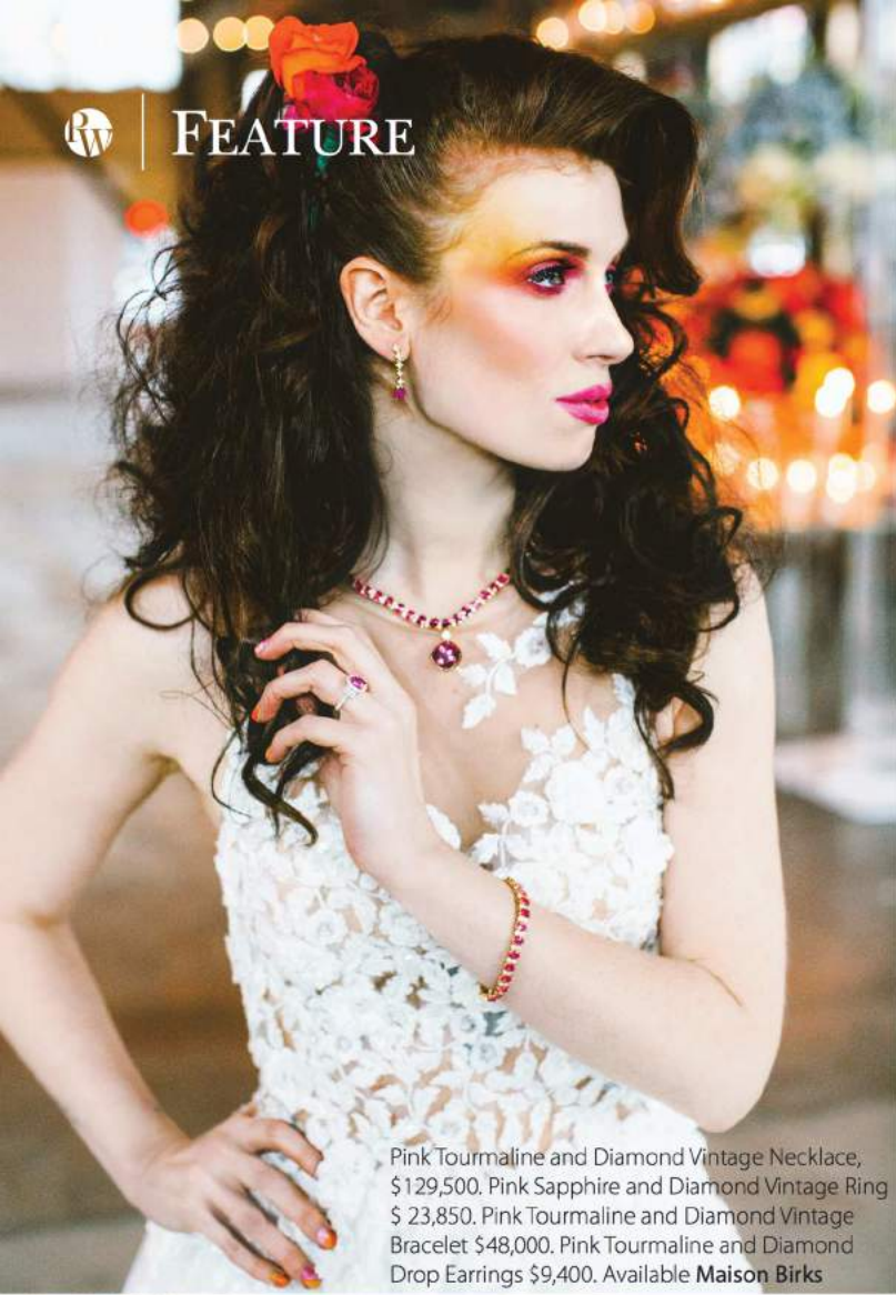
Pink Tourmaline and Diamond Vintage Necklace, $129,500. Pink Sapphire and Diamond Vintage Ring $ 23,850. Pink Tourmaline and Diamond Vintage Bracelet $48,000. Pink Tourmaline and Diamond Drop Earrings $9,400. Available Maison Birks