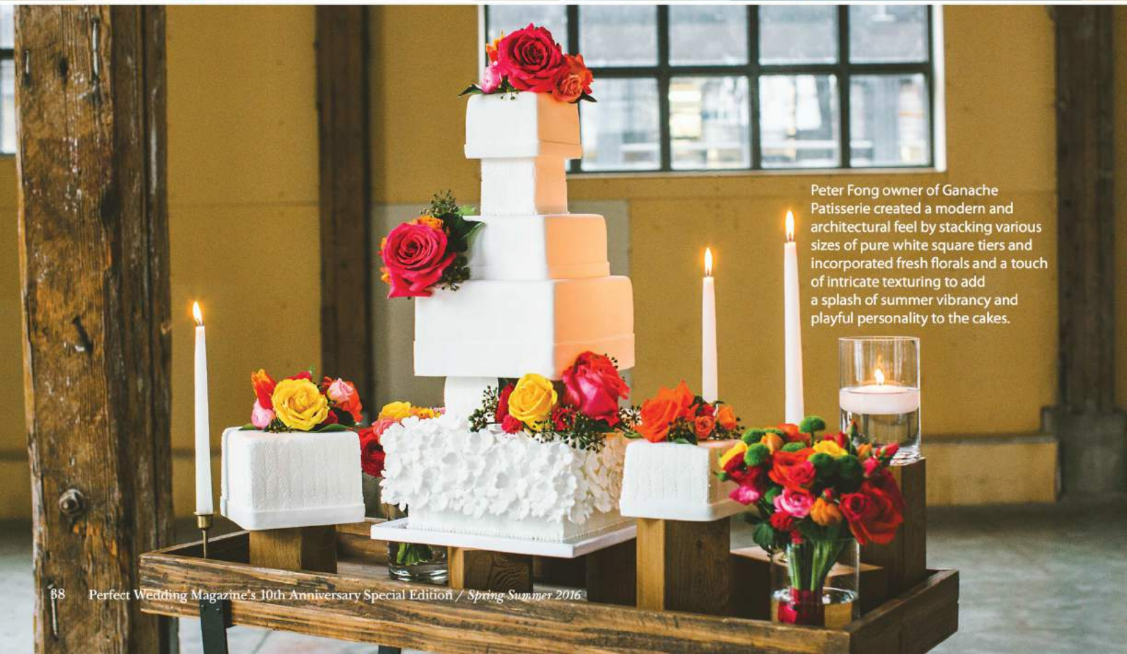
Peter Fong owner of Ganache Patisserie created a modern and architectural feel by stacking various sizes of pure white square tiers and incorporated fresh florals and a touch of intricate texturing to add a splash of summer vibrancy and playful personality to the cakes.