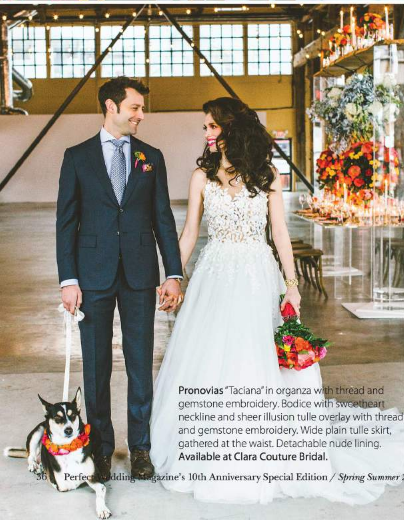
Pronovias "Taciara" in organza with thread and gemstone embroidery. Bodice with sweetheart neckline and sheer illusion tulle overlay with thread and gemstone embroidery. Wide plain tulle skirt, gathered at the waist. Detachable nude lining. Available at Clara Couture Bridal.