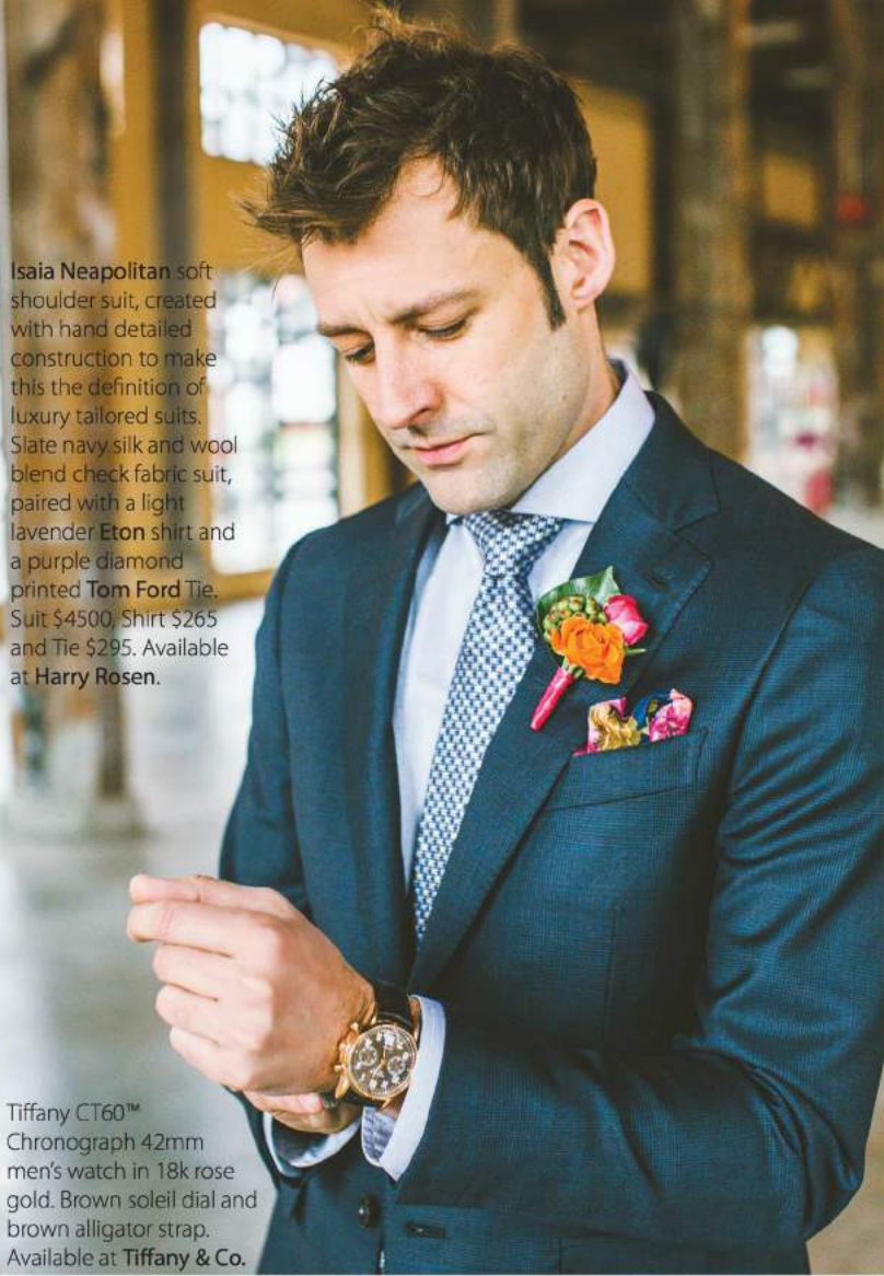
Isaia Neapolitan soft shoulder suit, created with hand detailed construction to make this the definition of luxury tailored suits. Slate navy silk and wool blend check fabric suit, paired with a light lavender Eton shirt and a purple diamond printed Tom Ford Tie. Suit $4500, Shirt $265 and Tie $295. Available at Harry Rosen .