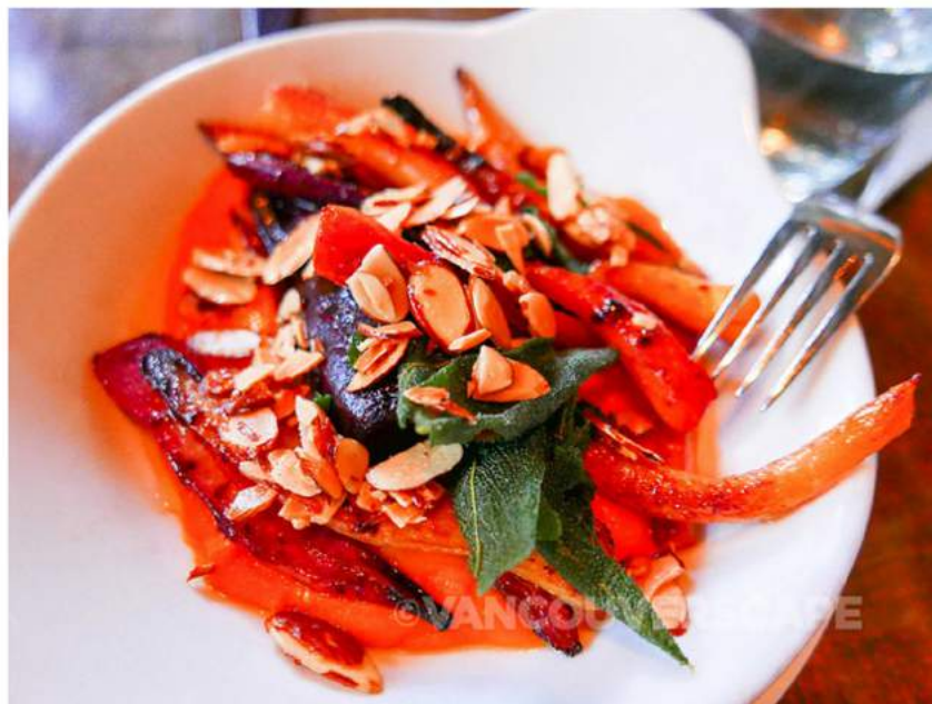
[Glazed carrots, brown butter almonds, fried sage]

I order the featured branzino filet served with spätzle, salsa verde and house made pancetta, such a wonderful combination of ingredients further complimented by a side dish of glazed carrots with brown butter almonds and fried sage.