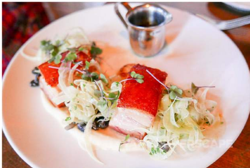
[Shaw Farms pork belly, seared BC scallops, celeriac, apple, calypso beans, fennel, pork jus]

The entire meal never felt rushed (we were in there for two hours allowing for plenty of conversation between courses).