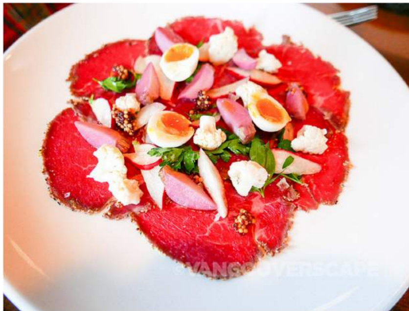
[Kettle Ridge beef carpaccio: AAA tenderloin, quail's egg, baby turnip, pickled cauliflower, pecorino]

A bright, pleasant asparagus salad is tossed with house-made ricotta, pine nuts and watercress, while the Kettle Ridge beef carpaccio is colourfully presented with AAA tenderloin, quail's egg baby turnip, pickled cauliflower and pecorino.