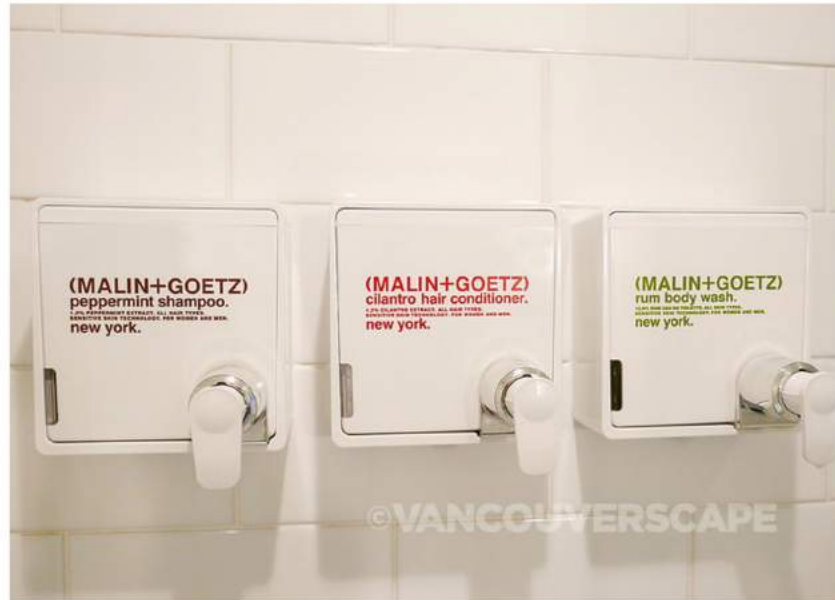
[Malin + Goetz toiletries]

The desk is situated right in the corner, with a lamp, ergonomic chair, phone and enough space to spread out and get to work. The wet bar contains a Nespresso machine, small fridge underneath and mini bar treats above (plus a variety of cold bevvy's in the fridge).