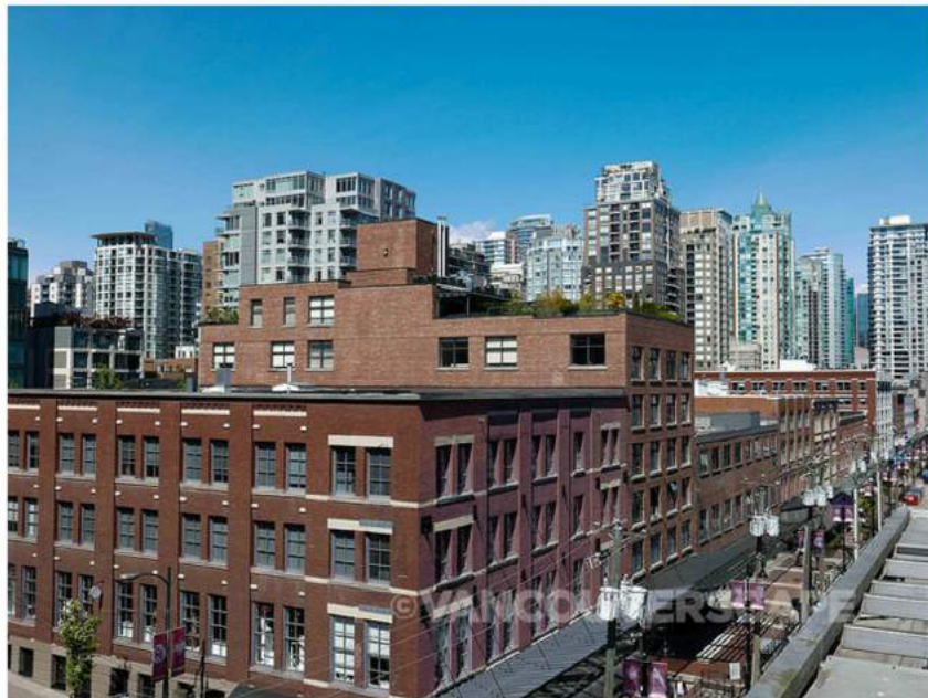
[Our Yaletown view]

The walls in Mike (the name of our room) are painted a deep rose with dark wood furnishings and pink and orange-upholstered couches. A large colour-drenched, framed painting of Vancouver's Eastside ( Cordova Street Cha Cha ) hangs on one side, a full-length balcony with floor-to-ceiling windows on the other. A deep red faux snakeskin headboard frames our king bed.