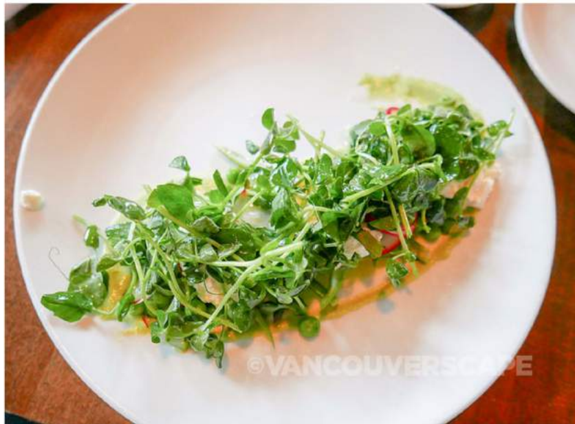
[Asparagus salad, house made ricotta, pine nuts, watercress]

A bright, pleasant asparagus salad is tossed with house-made ricotta, pine nuts and watercress, while the Kettle Ridge beef carpaccio is colourfully presented with AAA tenderloin, quail's egg baby turnip, pickled cauliflower and pecorino.