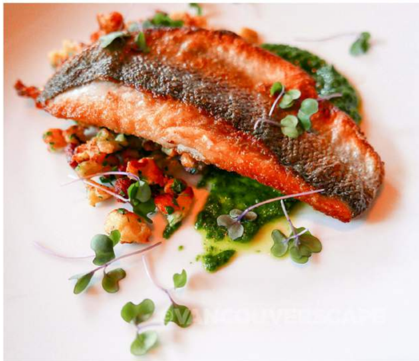
[Branzino filet, spätzle, salsa verde, house made pancetta]

I order the featured branzino filet served with spätzle, salsa verde and house made pancetta, such a wonderful combination of ingredients further complimented by a side dish of glazed carrots with brown butter almonds and fried sage.