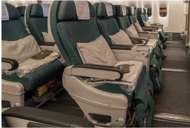
Cathay Pacific Premium Economy Cabin.

It's well priced, for one. But there are a lot of benefits to the premium economy class.