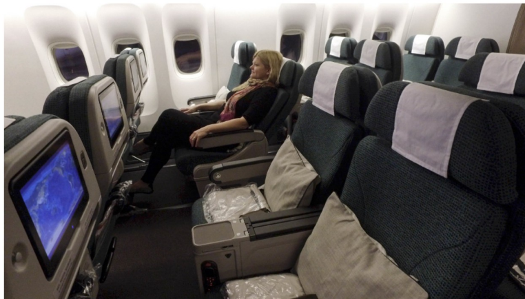
Cathay Pacific premium economy seats were quite comfortable and roomy

On our way home from Hong Kong, we flew Cathay Pacific premium economy and were pleasantly surprised. Not all premium economy airlines are created equal, and while I would have said Air Canada to Dubai and Air New Zealand to Australia had better seat layouts with a 2-3-2 seating set up, the Cathay Pacific premium economy flight to Hong Kong had a 2-4-2 set up that was still quite spacious. Plus, when looking at the seat arrangements on Air Canada's premium economy to Hong Kong, we saw that they too only offer the 2-4-2 layout. So that could be the norm for this route.