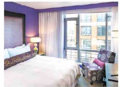
Fictional guest Susan, a fashion executive who loves yoga, inspired this room design.