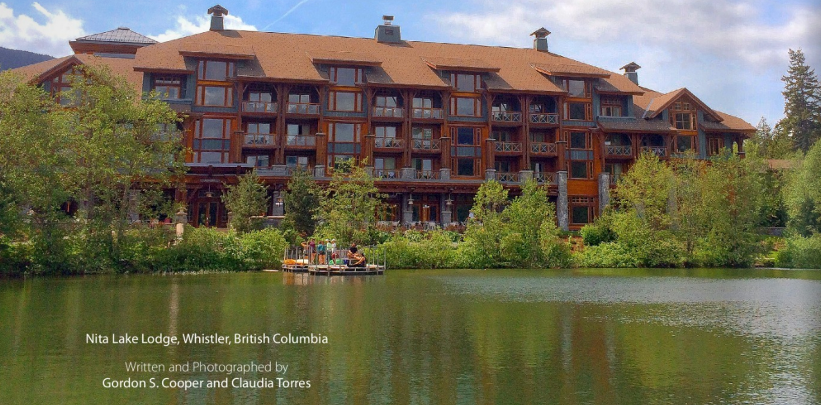
Nita Lake Lodge, Whistler, British Columbia