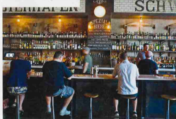
CLOCKWISE FROM TOP: COURTESY OF TOFINO RESORT/MARINA; KNOX; COURTESY OF VISIT NAPA VALLEY/BOB MCCLENNAN; BRYAN ASHLEY/REXUS