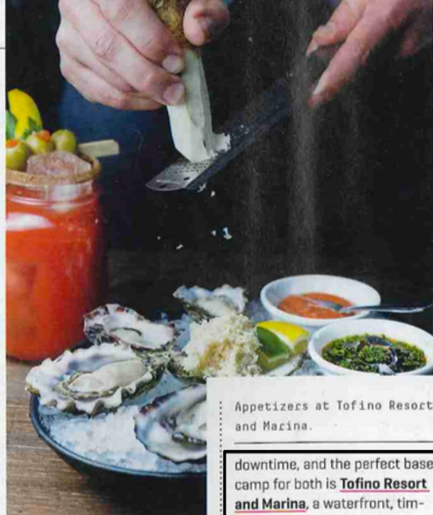
Appetizers at Tofino Resort and Marina.

Checking out the classic car collection while wine tasting at Far Niente , a winery with a stone carriage house full of Bentleys, Porsches, and other vintage autos that are as memorable as the wine. —B.B.