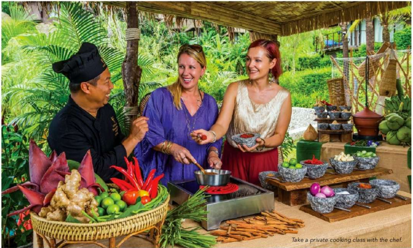
Take a private cooking class with the chef.

Seven Tree Pool Houses represent the “We-Ha” people, who worshiped the universe and lived suspended from the trees so as to be nearer to the sky. Then, seven Tent Pool Villas celebrate the wandering “Khon-Jorn” clan and their adventurous, semi-nomadic lifestyles, while 16 tiny, egg-shaped Clay Pool Cottages draw on the story of the agricultural “Pa-ta-Pea” clan. Each villa has its own private pool, which I’m sure would have delighted any clan member.